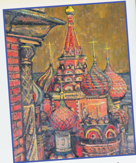
Place • Ivan IV has honored a Russian victory over the Tatars with the construction of St. Basil's Cathedral. ▲

The victory also added the lands of the Tatars, including their capital at Kazan, to our growing empire. Russians everywhere should be proud of Moscow's new church and of the victory it symbolizes.