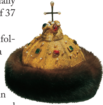
Region • Ivan the Terrible is said to have worn this fur-trimmed crown at his coronation in 1547. ▲

The poor farmers, or peasants, of Russia also suffered under the first czars. New laws forced the peasants to become serfs, who had to remain on the farms where they worked.