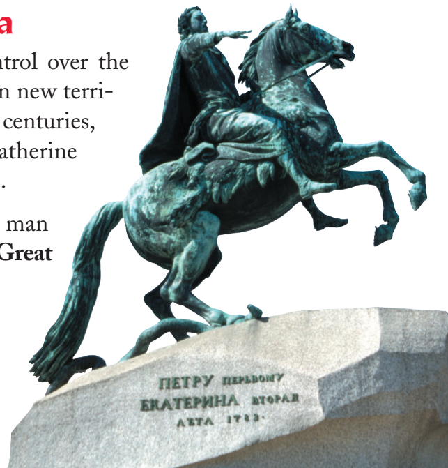
Movement • Peter the Great brought to Russia many of the improvements of the Scientific and Industrial Revolutions. ▲

One of Peter’s goals was to have closer ties with Western Europe. He hoped to use the ideas and inventions of the Scientific Revolution to modernize and strengthen Russia. During his rule, Peter reformed the army and the government and built new schools. He even ordered Russians to dress like Europeans and to shave off their beards. Peter’s reforms made Russia stronger, but they did not improve life for Russian peasants.